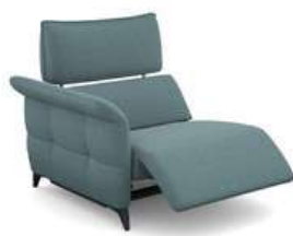
B150EL 107 cm x 95 cm x 100 cm 65 kg / 1 pcs / vol. 1,13 m 3