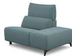
IS00TR 100 cm x 95 cm x 134 cm 40 kg / 1 pcs / vol. 0,82 m 3