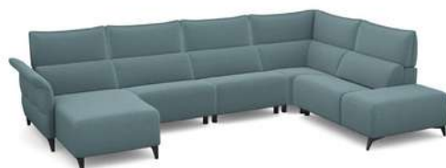
CH00TL + E150T + E150T + EK01T + IS00TL 372 cm x 95 cm x 160/234 cm 177 kg / 6 pcs