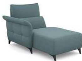
CH00TL 100 cm x 95 cm x 160 cm 48 kg / 1 pcs / vol. 0,98 m 3