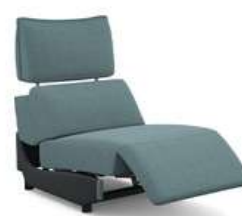
E100EL 65 cm x 95 cm x 100 cm 47 kg / 1 pcs / vol. 0,89 m 3