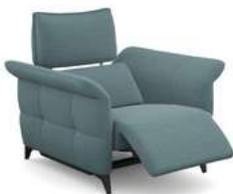
F1EL 107 cm x 95 cm x 100 cm 60 kg / 1 pcs / vol. 1,35 m 3