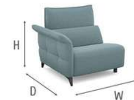
Dimensions W x H x D kg net / pcs / vol