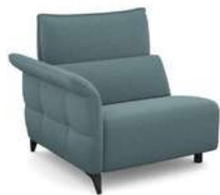
B150TL 107 cm x 95 cm x 100 cm 38 kg / 1 pcs / vol. 0,66 m 3