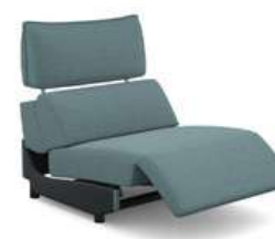
E150EL 86 cm x 95 cm x 102 cm 54 kg / 1 pcs / vol. 0,89 m 3