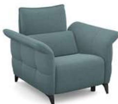
C100T 107 cm x 95 cm x 100 cm 40 kg / 1 pcs / vol. 0,65 m 3