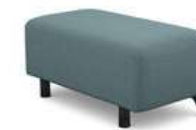
P010R 48 cm x 45 cm x 100 cm 14 kg / 1 pcs / vol. 0,25 m 3