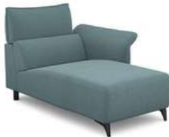
CH00TR 100 cm x 95 cm x 160 cm 48 kg / 1 pcs / vol. 0,98 m 3