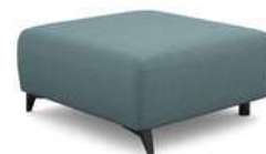
P003L 88 cm x 45 cm x 100 cm 23 kg / 1 pcs / vol. 0,42 m 3