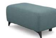
P010L 48 cm x 45 cm x 100 cm 14 kg / 1 pcs / vol. 0,25 m 3