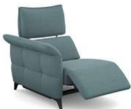
B100EL 86 cm x 95 cm x 100 cm 56 kg / 1 pcs / vol. 0,85 m 3