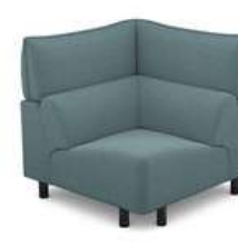
EK01T 100 cm x 95 cm x 100 cm 35 kg / 2 pcs / vol. 0,61 m 3