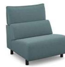
E150T 86 cm x 95 cm x 100 cm 27 kg / 1 pcs / vol. 0,53 m 3