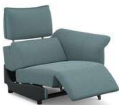
B100ER 86 cm x 95 cm x 100 cm 56 kg / 1 pcs / vol. 0,85 m 3