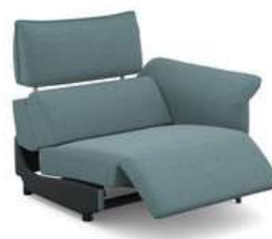
B150ER 107 cm x 95 cm x 100 cm 65 kg / 1 pcs / vol. 1,13 m 3