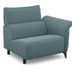
B150TR 107 cm x 95 cm x 100 cm 38 kg / 1 pcs / vol. 0,66 m 3