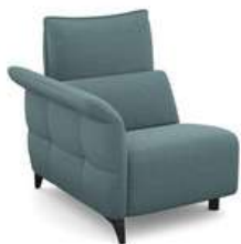
B100TL 86 cm x 95 cm x 100 cm 36 kg / 1 pcs / vol. 0,53 m 3