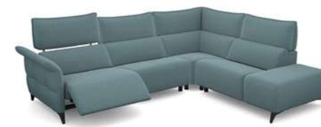
B150EL + E150T + EK01T + IS00TR 293cmx95 cm x 100/234cm 167 kg / 5 pcs