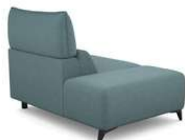
IS00TL 100 cm x 95 cm x 134 cm 40 kg / 1 pcs / vol. 0,82 m 3