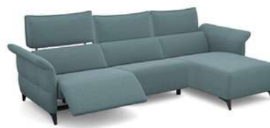
B150EL + E150T + CH00TR 293cmx95 cm x 100/160cm 140 kg / 3 pcs