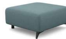
P003R 88 cm x 45 cm x 100 cm 23 kg / 1 pcs / vol. 0,42 m 3