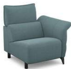
B100TR 86 cm x 95 cm x 100 cm 36 kg / 1 pcs / vol. 0,53 m 3