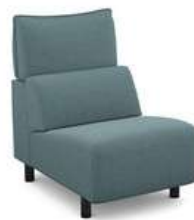
E100T 65 cm x 95 cm x 100 cm 25 kg / 1 pcs / vol. 0,41 m 3